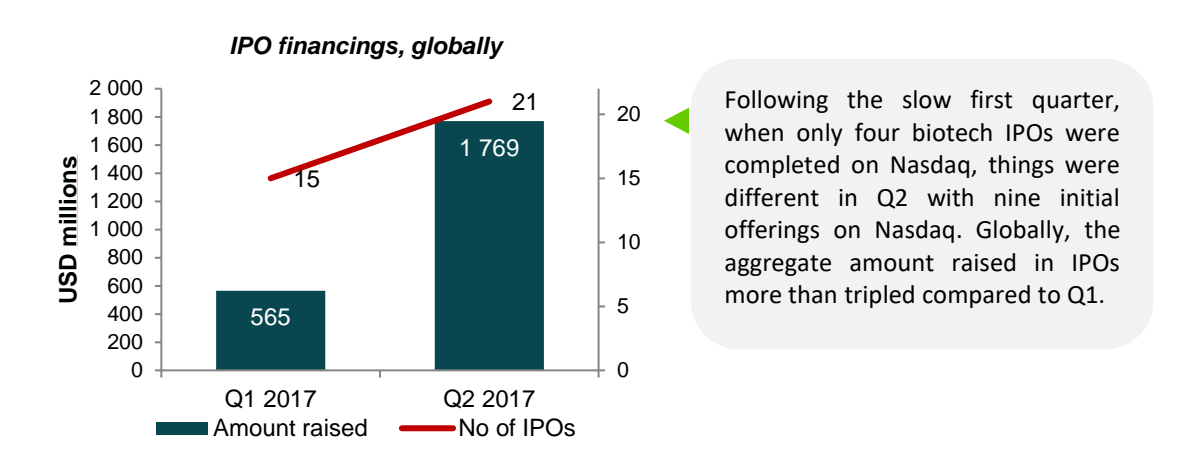
Biotech IPO financings.

The US IPO market recovered from low levels earlier this year and has, according to bankers, reached a healthy equilibrium where high-quality companies can attract investor interest at reasonable valuations. Eleven companies completed their IPOs on the US markets in Q2, all pricing within their expected valuation ranges. As a reference, about a third of US IPOs in 2014-2016 priced below their respective valuation ranges.