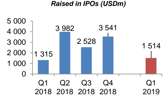
IPO financings.

The IPO financing climate was slow in the first quarter just as the opening quarter of each year usually is. In Q1 USD 1.5 billion was raised in 15 completed IPOs, less than half of both the amount and number of IPOs compared to the previous quarter, but many analysts also attributed the significant drop to the US government shutdown. There has also been some concern expressed that companies might have difficulties reaching targeted valuations in their public floatation, as many pre-IPO rounds are completed at a high pricing.